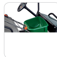
Spacious Interior means plenty of room for equipment and canine crew members.