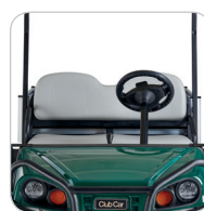
High-Visibility Dash enhances sight lines for an unobstructed view. *Optional windshield available

The Carryall 502 was expertly designed with your needs in mind. With extra room, and a high-visibility dash, you can now manage and care for your course without interruption.