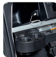
Console with Standard Dual USB & Multi-Use Cup Caddy keeps devices charged and drinks, radios, and tools secure.

Visit clubcar.com for more on Carryall's warranty.