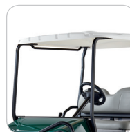
Extra-Wide Monsoon Canopy for fast drainage and better water management.