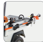
Upper & Lower Tool Holder Kit