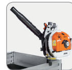
Backpack Blower Rack