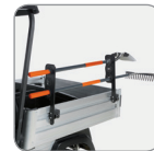
Multi-Tool Holder Kit